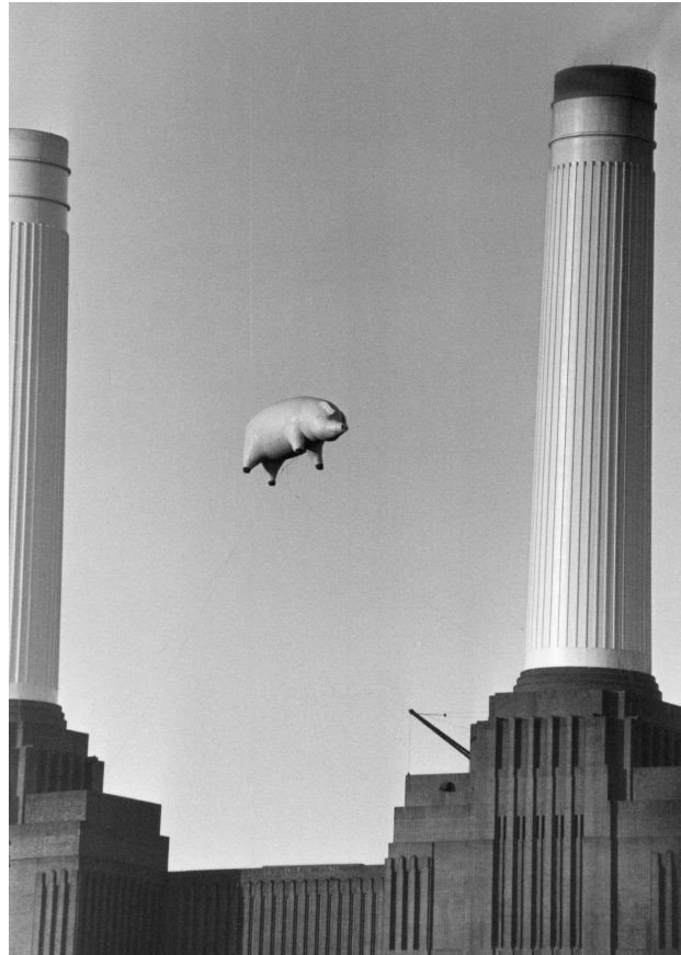
A 12-metre long inflatable pig suspended between two of the chimneys at Battersea Power Station, during a photoshoot for the cover of Pink Floyd's album 'Animals', in November 1976.

The completed project will have 25,000 people living and working on the site, making it one of London's largest office, retail, leisure and cultural quarters with 250 shops and cafes, restaurants, a theatre, hotel and cinemas, as well as 7.68 hectares of public space, including a park.