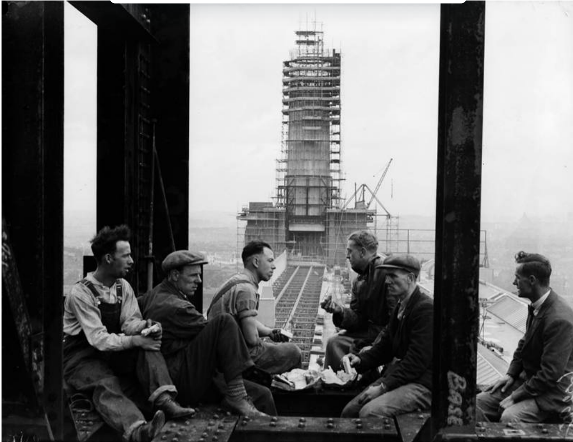
Construction workers take a lunch break with the 300ft high chimney of Battersea Power station, which was nearing completion, in the background in July 1932.