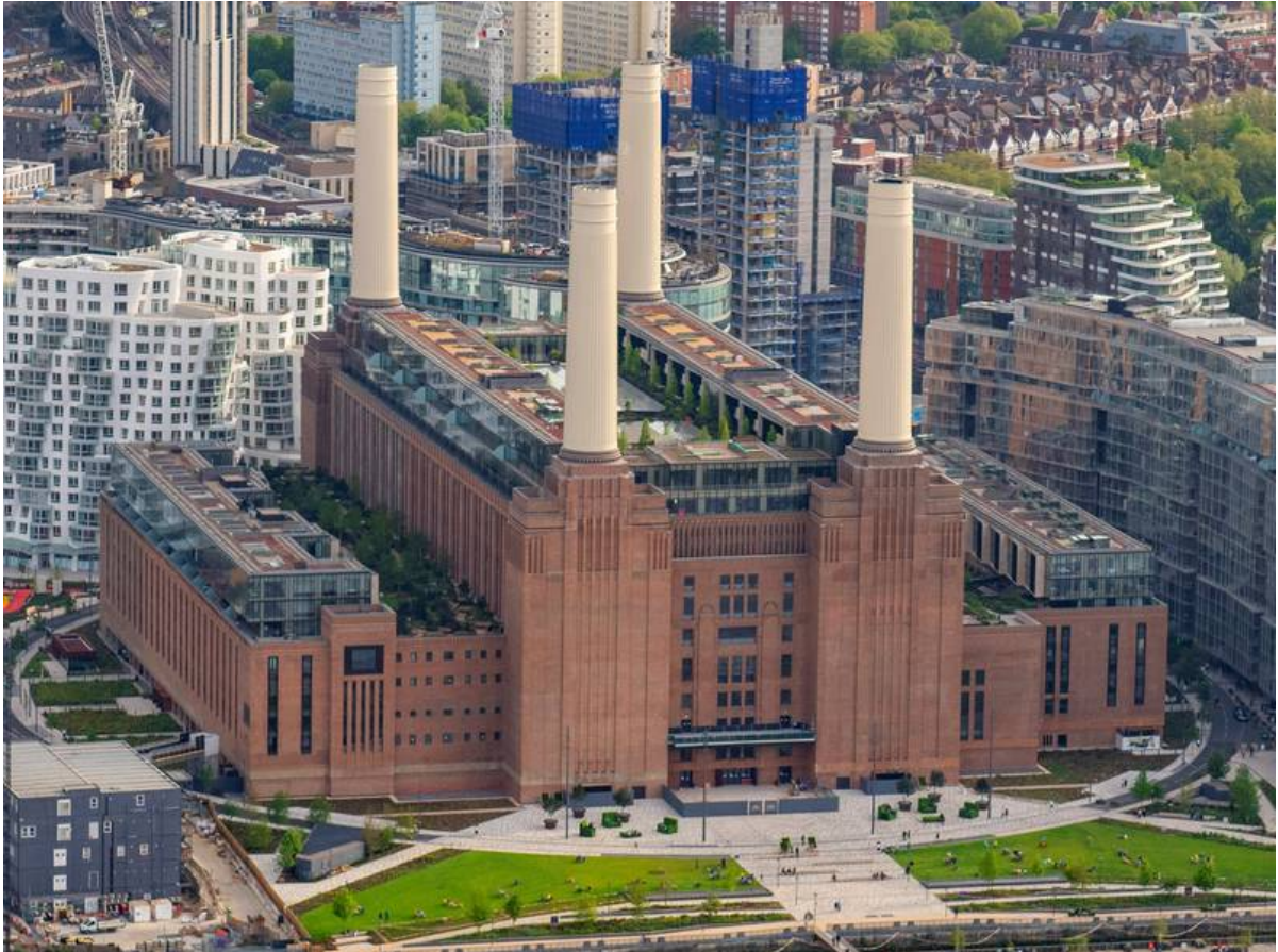
Battersea Power Station in London.

► Residents, workers and shoppers are moving into London's most celebrated redevelopment